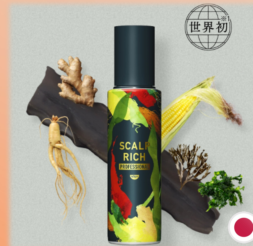
Nissin Foods Scalp Rich Professional, Price Unavailable , June 2023